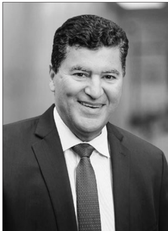
ELIAS ZERHOUNI, MD

He also is a member of the U.S. National Academy of Medicine and the U.S. National Academy of Engineering. Dr. Zerhouni received the prestigious Legion of Honor medal from the French National Order in 2008 and was elected in 2010 as a member of the French Academy of Medicine. He was appointed Chair of Innovation at the College de France in 2011.